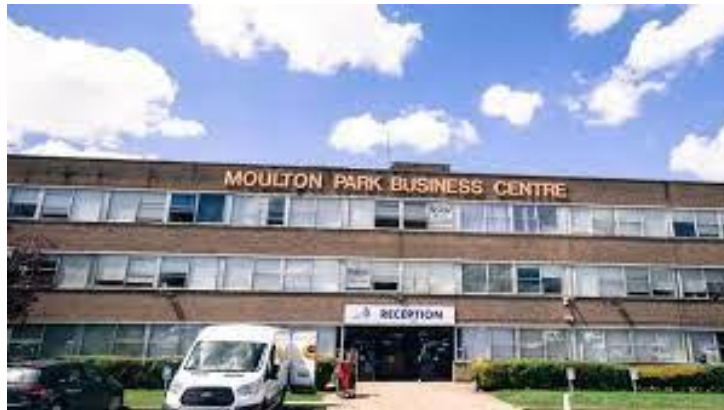
Moulton Park Business Centre – the course location

If you have any questions or require any further information about anything in this guide then please send an email to: training@sierra.uk